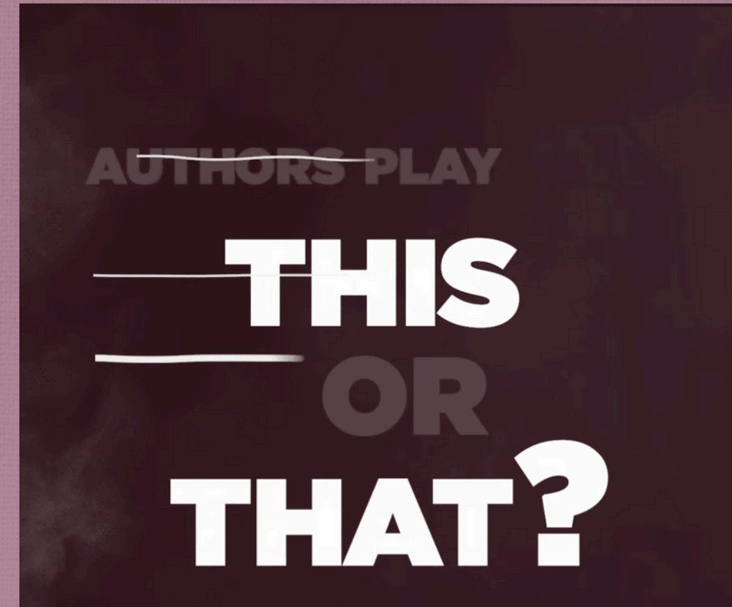
Harlequin Authors Play This Or That