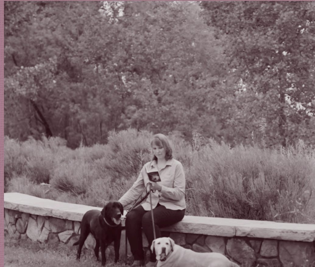
5 Things You Didn't Know About Dogs with Jobs