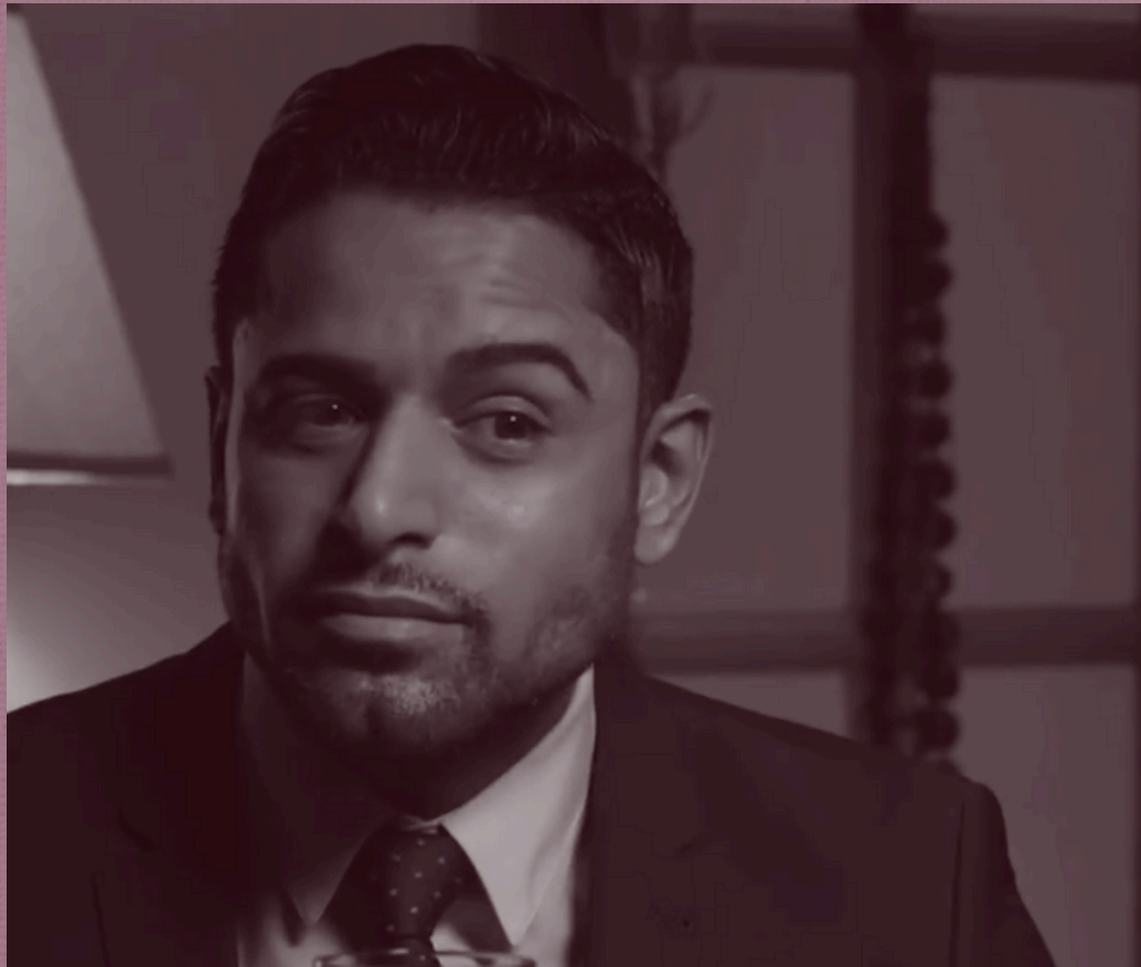
Harlequin: Your Happy Place Finalist in 2019 Content Marketing Awards

Bringing your vision to life starts with the right concept, and the right collaborators. From launching a dynamic cooking series to crafting a scroll-stopping ad, I specialize in developing standout ideas and assembling top-tier production talent to deliver video content that captivates.